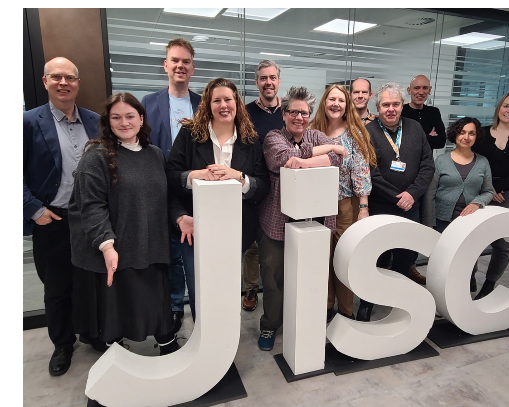
Team meeting, February 2024. JISC Offices, London.

In 2014 Open Planets Foundation changed its name to the Open Preservation Foundation (OPF) to reflect our evolution and relevance within a growing field. The OPF operates as an independent, not-for-profit membership organisation, welcoming digital preservation practitioners from around the world to our open source community